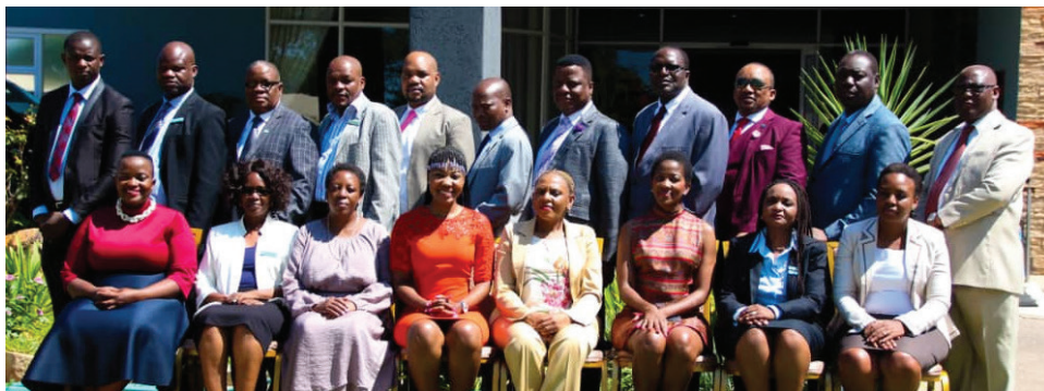
Botswana Ministry of Local Government and Rural Development and staff of Progressive Institute in Gaborone